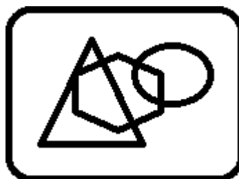
Fig. 1. Title of the figure

Tables, figures, diagrams should have numbers and titles (300 dpi in tif или jpg format):